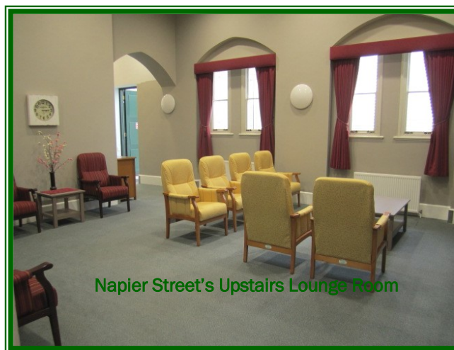
Napier Street's Upstairs Lounge Room