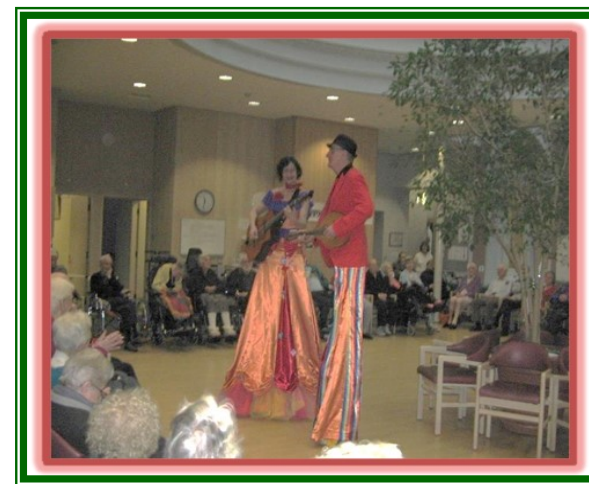
Day Centre and Hostel Event

If you are any of these people, we hope to hear from you soon.